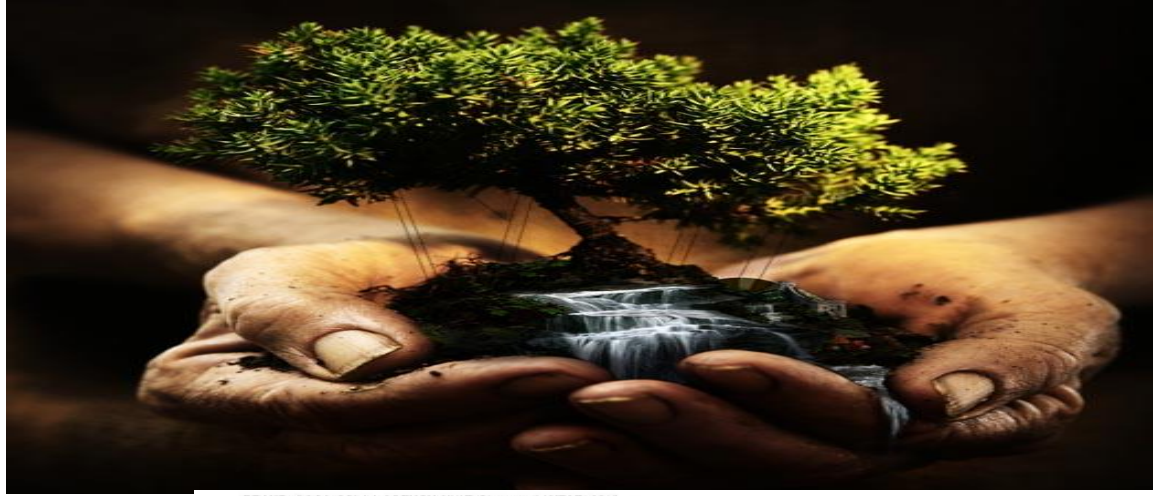
BRAND: COCA-COLA | AGENCY: KULT (Singapore) | YEAR: 2010 DETAILS: Visual works for a COCA-COLA Campaign: "Coca-Cola Red Wave experience"